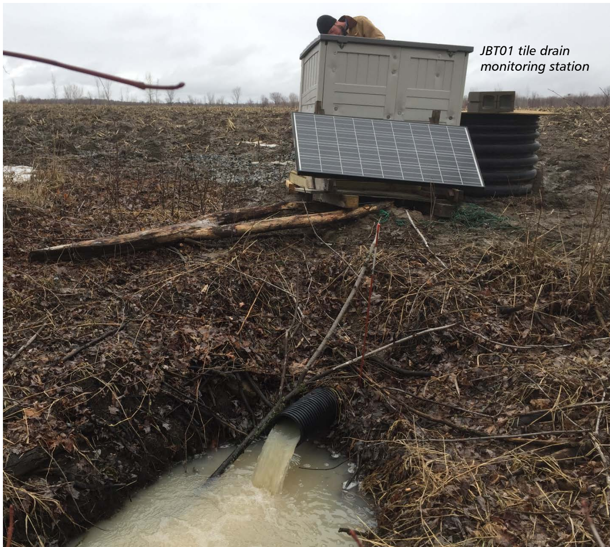
JBT01 tile drain monitoring station