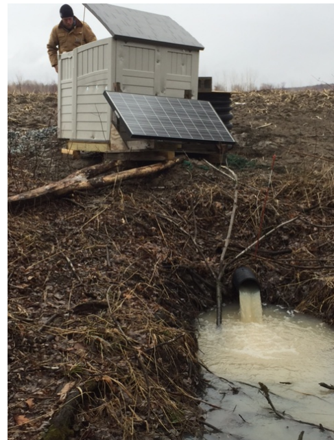
Completing monitoring station construction at JBT01.

A tremendous effort was devoted in the last quarter to manipulating flow data and identifying and making estimates for any gaps in the continuous (15-minute) flow and concentration time series data. This laborious